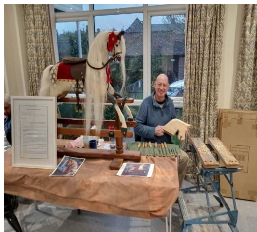
Before the show started