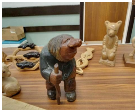
The troll that 'started it all' for Wendy