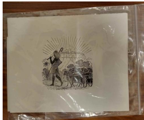
The design on paper