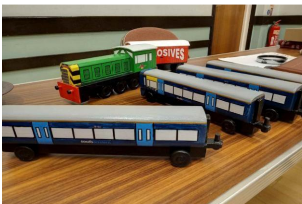
Some of Ian's toys